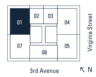
Floors 43 - 44